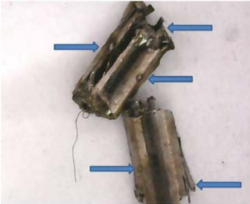
Tungsten cylinders after reaction, with craters and cracks